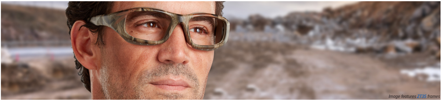
Image features Z135 frames

Size 65-16-120 Color Gloss Black | Matte Navy | Matte Tortoise | Pearl/Orange Temple Standard Side Shields Integrated